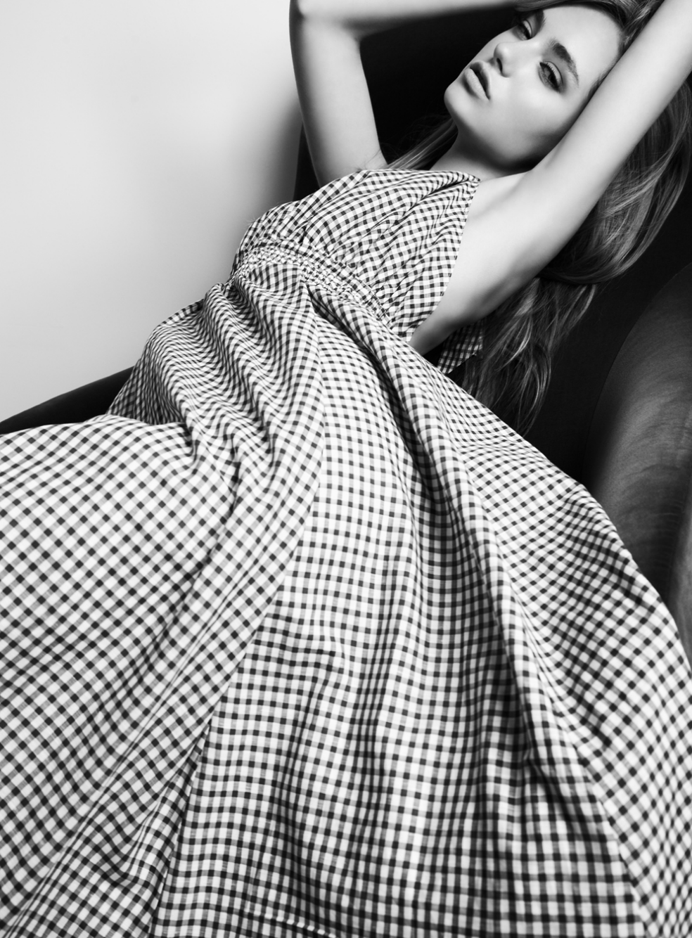
Amanjeda Women's pret-a-porter collection Spring - Summer 2014